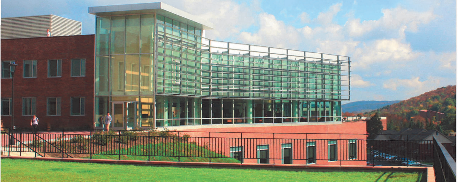
STUDENT LEADERSHIP CENTER